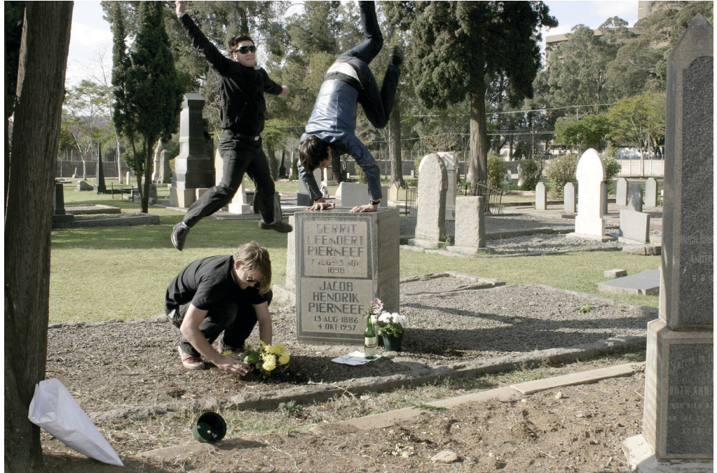
FIGURE Nº 10