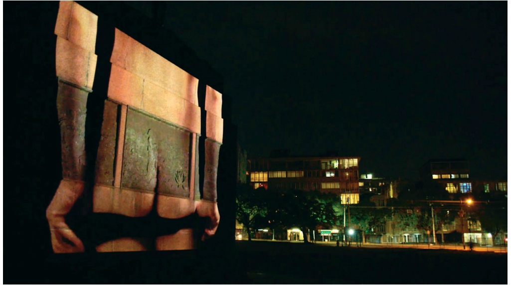
FIGURE N° 4