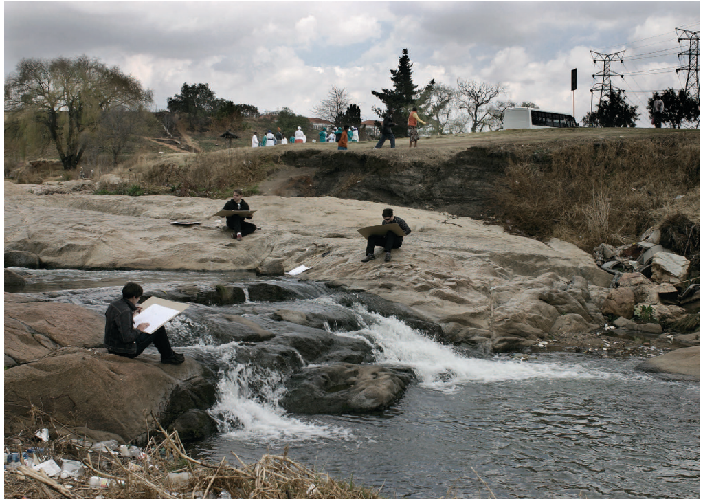
FIGURE N° 9