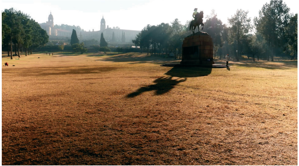
FIGURE Nº 1