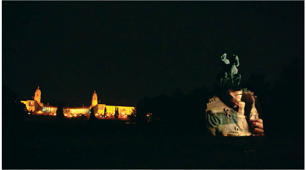
FIGURE Nº 3