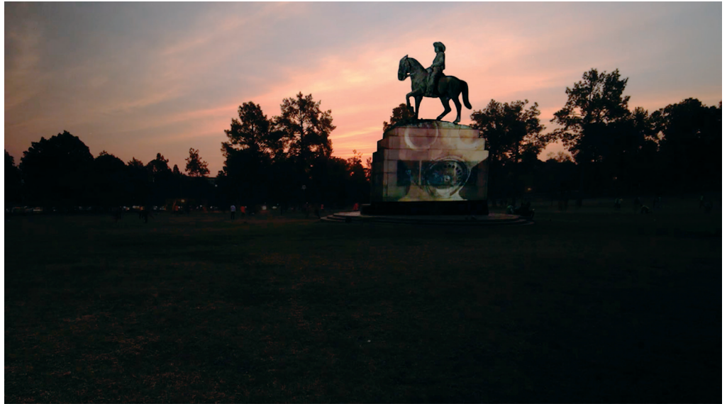
FIGURE Nº 2

Equestrian statues were a sign of cultural status. They were expensive and complicated to design, necessitating an artist to tackle both the human form and the movement of a horse. The imposing statues also physically and symbolically elevated a recent ruler to an ancient paragon.