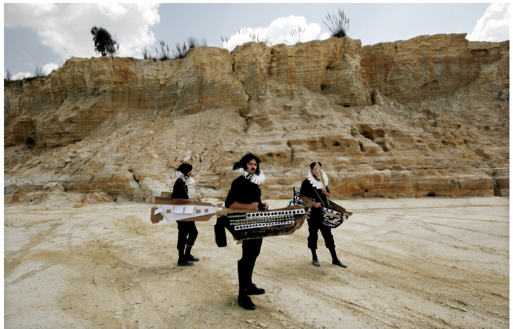
FIGURE N o 7

While land dispossession has blighted the relationship of black people with South African land and landscapes, which is evidenced in the western biases in landscape representation pointed out by Coetzee and scholars such as Elizabeth Rankin (2010), the position of whiteness in relation to landscape is fraught in the post-apartheid context. One may make the argument that whiteness is facing a profound crisis of belonging, as scholars in whiteness studies such as Melissa Steyn (2001,2005), Anthea Garman (2014:211-228), Georgina Horrel (cited by Garman 2014:215), Helene Strauss (cited by Garman 2014:216), and Charles Gabay (2018) have done. 'White anxiety' may be seen as related to this threatened ideological position, with the perceived power and superiority of whiteness being fundamentally questioned (Gabay 2018:1-45). Settler notions of belonging in the South African landscape are tenuous and if one considers arguments made by Coetzee (1988), Jeremy Foster (2003), and Lize van Robbroeck (2019), it is also fragile and constructed. Artists such as Avant Car Guard engage with this crisis of white identity, which is based on place and on the tradition of landscape representation, and which is in turn now often regarded as nationalist, and racist. Like Emmanuel, their dialogue with the spaces in which they place themselves, thus has to take the form of critique, and they combine it with irreverence and humour.