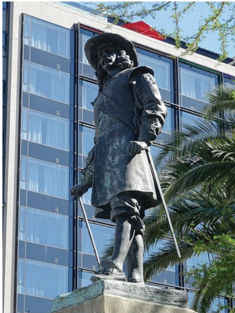
FIGURE N° 8

In the work they produced around the end of the 2000s, Avant Car Guard inscribe themselves in landscapes where they occupy an awkward position, and at times they point this out. In Stupid Fucking White Man (Figure 7), they are masquerading as Dutch settlers, in amateur costumes with cardboard ships. They are absurdly “stranded” on a landscape of mine dumps. Mining itself has a colonial history in South Africa, and the landscape of mine waste could be seen as the ecological consequence of colonial and apartheid ravaging of the natural resources in the country. Avant Car Guard’s parodic performance points to their own settler heritage as ‘stupid fucking white m[e]n’. Their engagement with settler history is performed through their own ephemeral figures appearing in cardboard costumes on a deserted mine dump, instead of through the established monumental vocabulary of impressive bronze sculptures such as Jan van Riebeeck’s 17 statue on Adderley street in Cape Town (Figure 8). 18