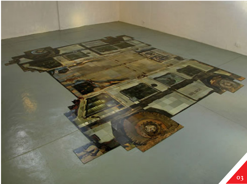
Figure 3: Anton Karstel, 108166N , 2004 Installation, 7 x 6m Courtesy of artist and Visibility/Commentary Exhibition Catalogue (UP)