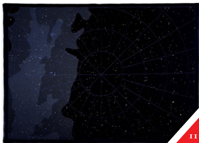
Figure 11: Berco Wilsenach, Astrodeiktikon , 2007. Velvet cushions, pins and staplers. 1470 x 970mm