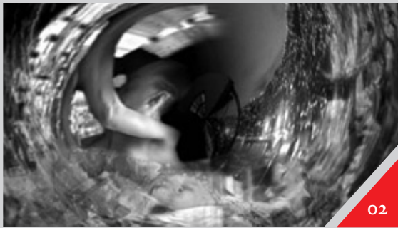
Figure 2: Minnette Vári, Fulcrum , 2007. Digital video still. Duration: Video 2'30" Stereo Audio 5'00" Looped. Courtesy of artist and Goodman Gallery.