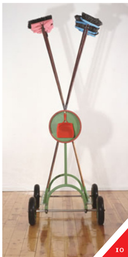
Figure 10: Johann van der Schijff, Hemelbesem (Heaven's broom) , 2005. Galvanised and painted mild steel, stainless steel, aluminium, brass, wood, bristle, plastic, rubber 272 x 138 x 100cm